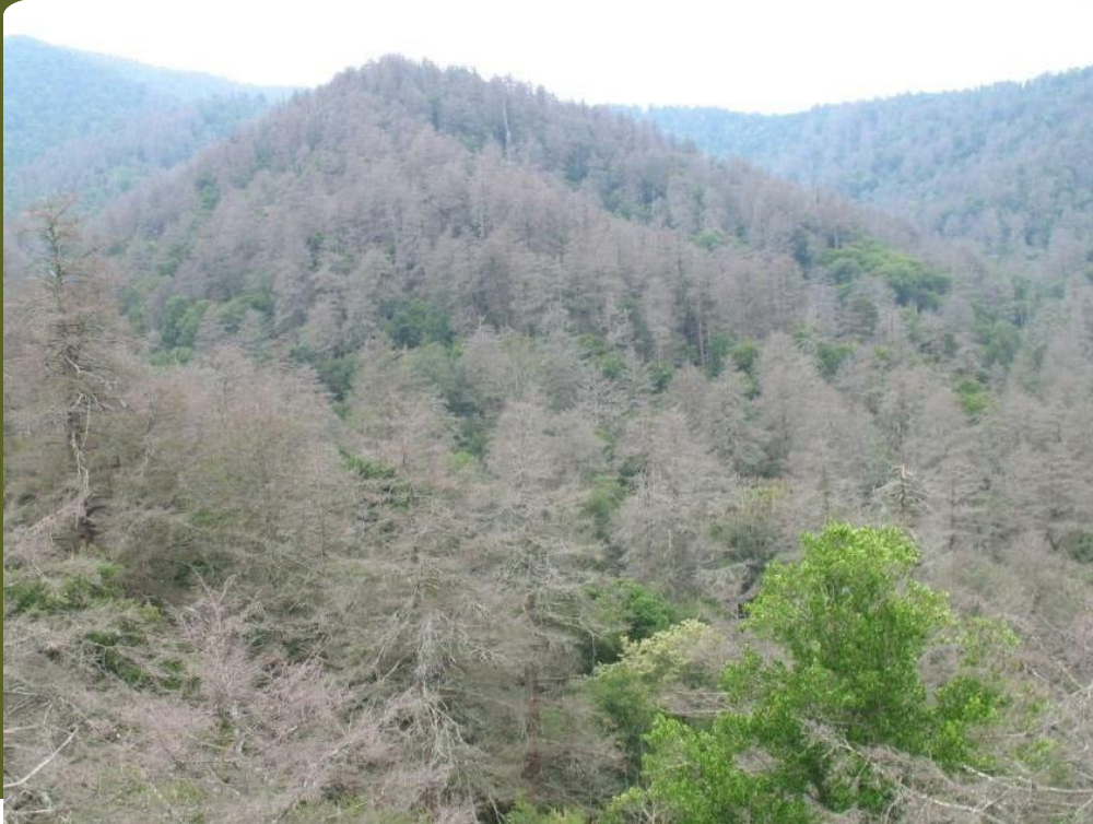
Hemlock mortality due to HWA in the Great Smoky Mountains