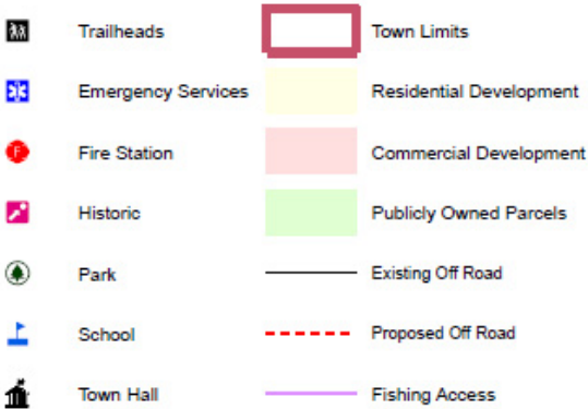
Figure 2: legend for 2024 Wilton Trail plan map