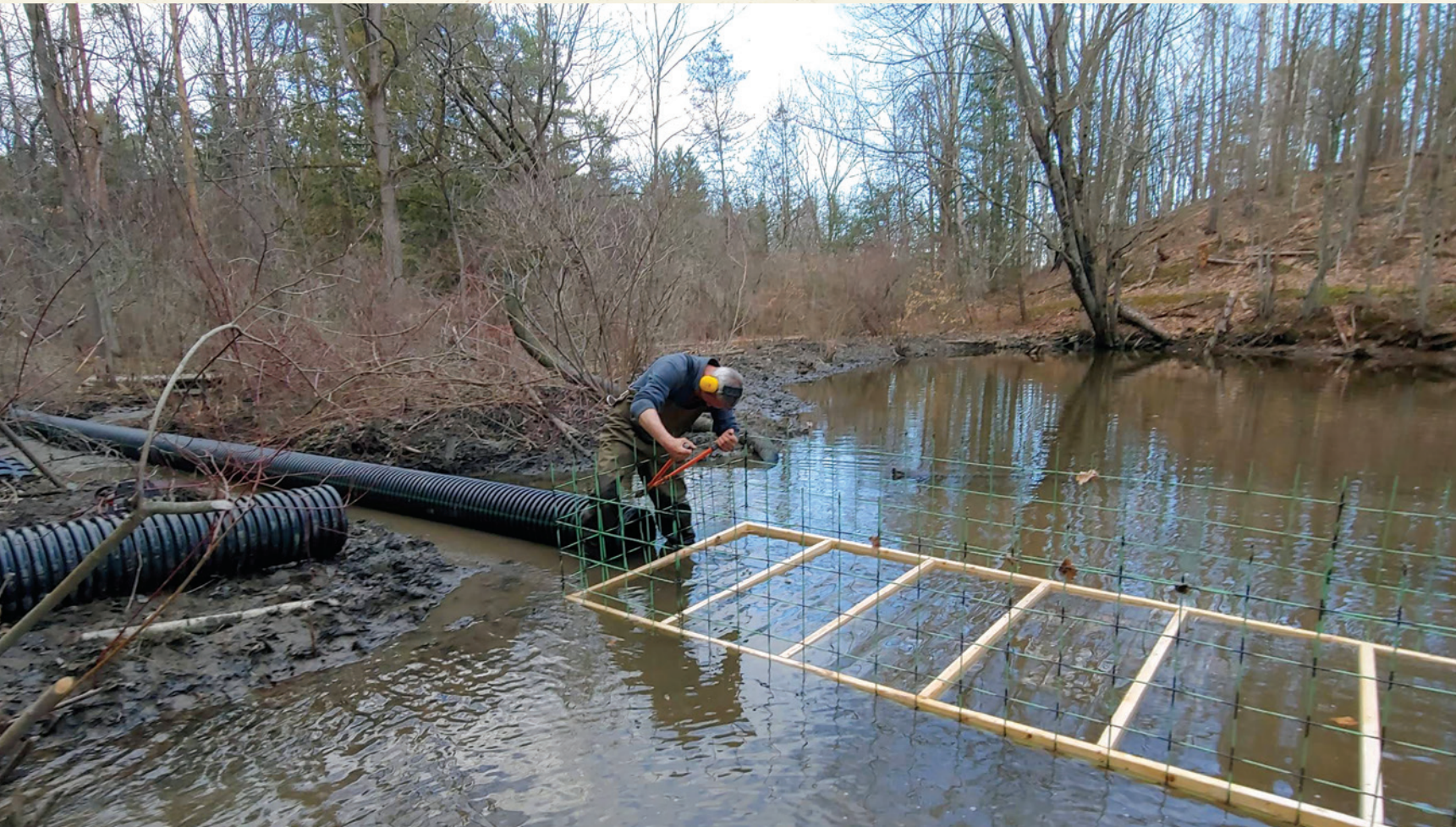
Wildlife expert Skip Lisle installs a beaver baffle at the Galway Preserve. The underwater piping diverts water, preventing flooding of trails, roads and adjacent properties and allowing beavers and humans to harmoniously coexist.