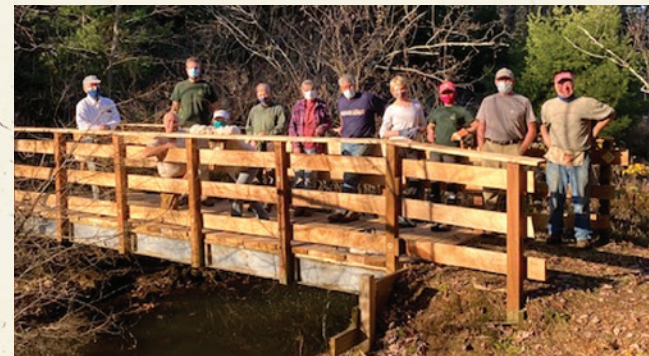
The Monday Stewards replace a bridge at the Coldbrook Preserve. Special thanks to King Dairy for providing field access and tractors for the project.