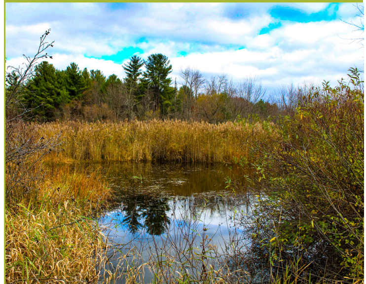
Bog Meadow Pond