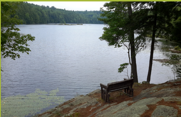
Lake Bonita in the Palmertown area