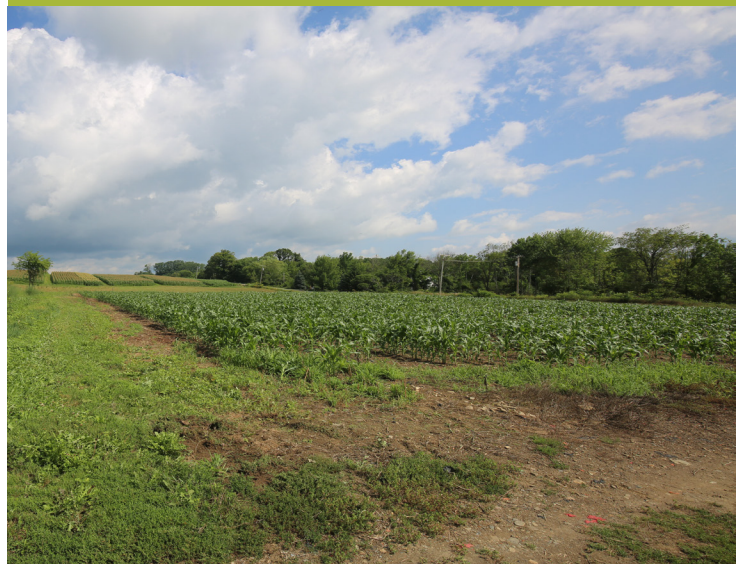
Farm located in West Charlton, Saratoga County