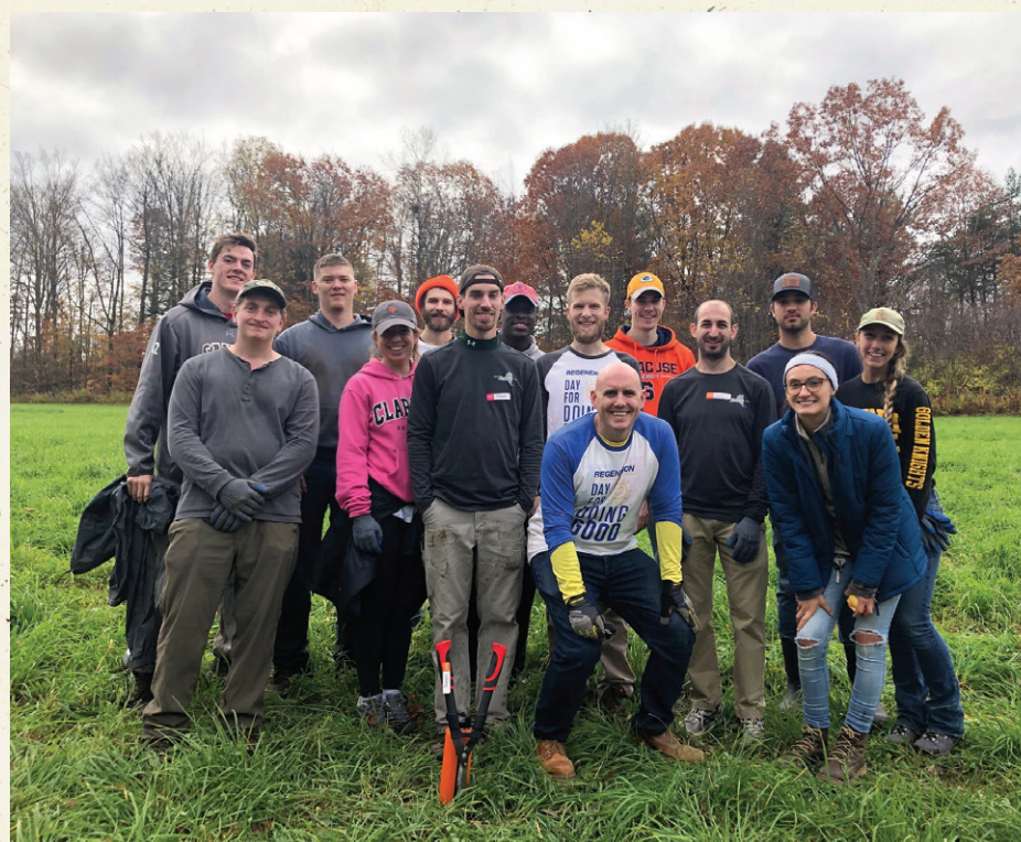
(clockwise from top left) Death Wish Coffee, Ballston Spa National Bank, Regeneron work crews