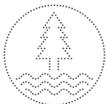
PROTECTING WOODS + WATERS