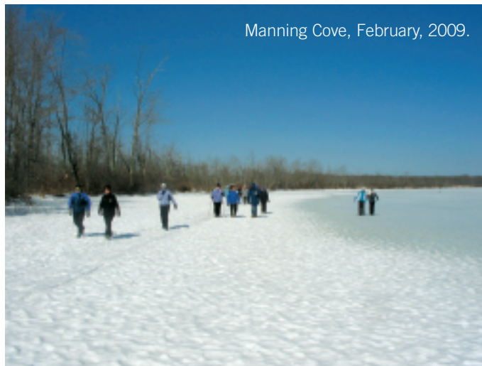
Manning Cove, February, 2009.

Twenty-eight brave souls walked on water in February to view this new 159-acre preserve. Located on the west side of Saratoga Lake just north of the Sailing Club, this wetland site is best toured in winter by snowshoe when the ground is frozen or in summer by boat. Home to muskrats, migratory waterfowl, wild rose, speckled alder, and sedges, this wonderful wild place helps filter sediments and pollutants from the incoming watershed before they reach the lake. The Winter Festival, lake neighbors, and other supporters have contributed $9,000 for ongoing stewardship of this site; we're still $41,000 short of our goal. Please help conserve this special place by making a contribution.